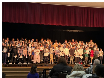
5th/6th Grade Music Concert