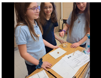
"Weathering" Sugar Cubes