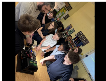
4th Grade ELA Book report presentations