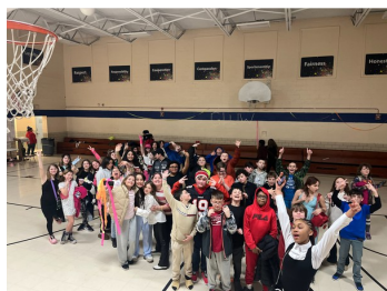
6th Grade Dance