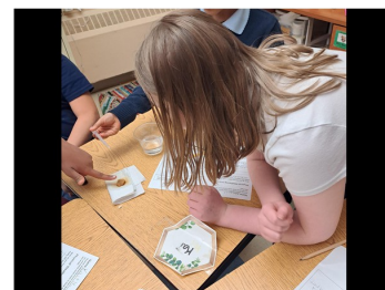
"Weathering" Sugar Cubes