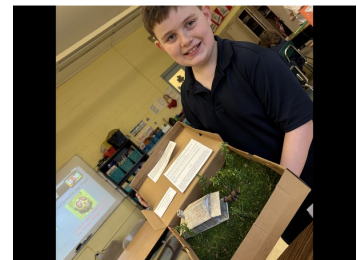
4th Grade ELA Book report presentations