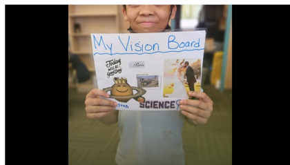
Vision Board Creation