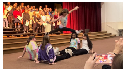
5th/6th Grade Music Concert