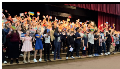
5th/6th Grade Music Concert