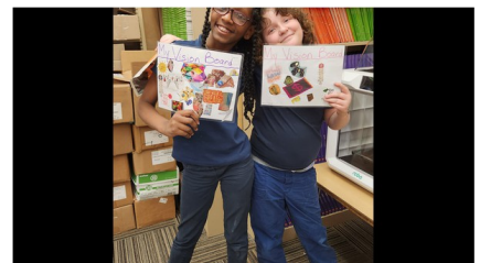
Vision Board Creation