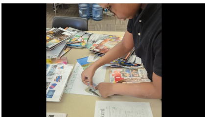
Vision Board Creation